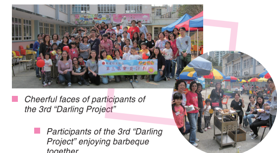
■ Cheerful faces of participants of the 3rd "Darling Project"

One of the major programmes this year was the 3rd "Darling Project" held on 23 March 2013. Underprivileged families of the community were invited to the Hall to participate in a half-day programme and a barbeque. The expenses of the programme were supported by the staff and their relatives.