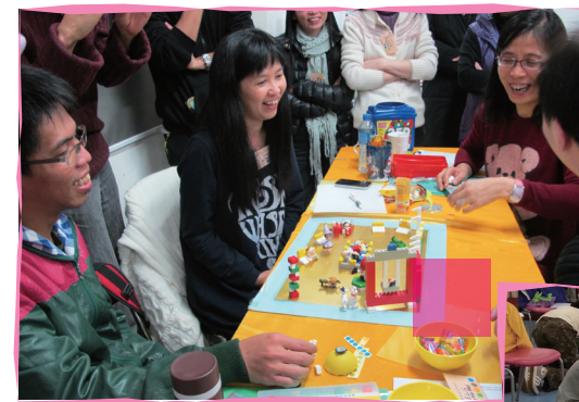
■ Personality Dimensions® Qualified Facilitator Certification

With the Social Welfare Development Fund allocated by SWD, staff members attended 157 in-service training programmes during the year, of which 11 were overseas study visits and 3 were leadership and management skills development programmes for mid-level staff. A total attendance of 2,291 was recorded. Besides, sponsorship was granted to 28 staff members to attend fieldwork placement and 3 staff members to attend nurse training programmes. These training had strengthened staff's professional skills and broadened their horizon, in particular after joining the mental health training at Yale University.