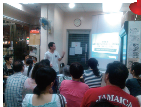
■ Caritas Residents Mutual Help Centre - Sham Shui Po held community meeting to mobilize low-income families to discuss their housing needs

Caritas Residents Mutual Help Centre - Sham Shui Po had organized and held several community meetings to mobilize the low-income families who were inadequately housed in private buildings to discuss their housing needs. They expressed their views on rent control and housing policies, rent control legislation and the supportive policy for inadequately housed families.