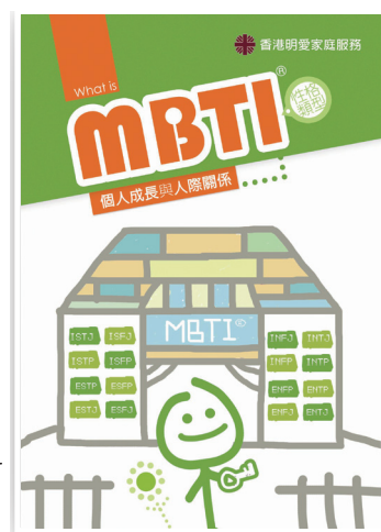
Book cover - "MBTI® Personality Types - Personal Growth and Inter-personal Relationship"

The book is written by experienced social workers (Certified MBTI® Practitioners) from Caritas Family Service. Authors introduced the theories of MBTI® Personality Types with concrete case examples. It facilitated continuous learning for people who participated in the individual assessment services or team training programmes. For readers interested in personal growth and inter-personal relationship enrichment, this book facilitated basic understanding of the individual differences of human beings.