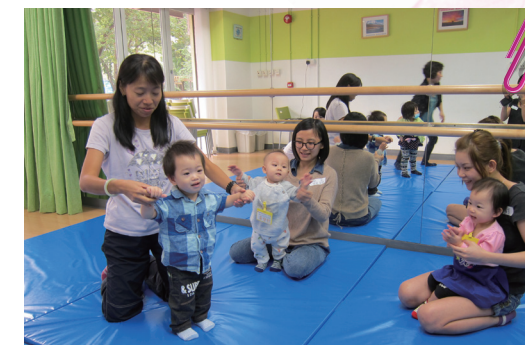
■ Parent-child musical training – Wow! The babies are dancing!

educational psychologists and dentists, distribution of resource books and setting up of a Resource Corner. A mutual support network “Super Baby Club” is also set up. Regular input of parent-child programmes on “character education” is provided.