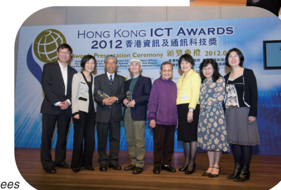
■ Group photos of the nominees