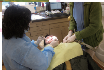
■ Service user received the dental inspection and treatment