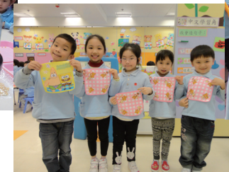
■ “We learn to share with others!”