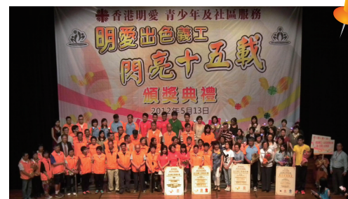
■ The event giving recognition to the volunteers

The Outstanding Volunteer Award Ceremony was held at the Hong Kong Baptist University Academic Community Hall on 13 May 2012 with 652 volunteers from different age groups. The most special Golden Green Badges were conferred to 71 volunteers who had devoted in volunteer services for 15 consecutive years. Besides, 37 Outstanding Volunteers and 10 Outstanding Volunteer Projects were selected and awarded.