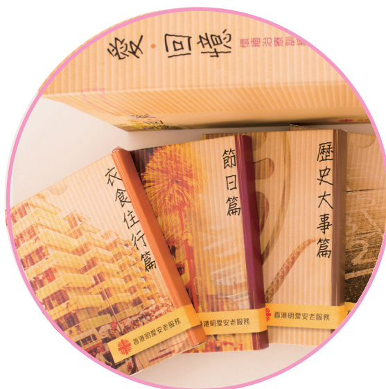
■ The reminiscence training kit for demented elders

A kit on reminiscence training for demented elders – “愛回憶” was compiled with the concerted efforts of two Occupational Therapists. It helped frontline staff to conduct reminiscence therapy. Two training sessions on the use of the kit were conducted on 27 February 2013 and 7 March 2013. A total number of 114 participants attended the training.