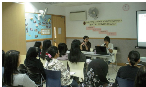
■ Women Migrant Workers listened attentively to the Chinese practitioner in explaining the healthy soups and massage to improve the menstrual problems