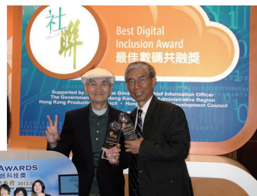
■ The two awardees