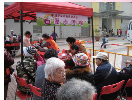
■ Road show on health assessment

Two members of Caritas District Elderly Centre – Yuen Long were awarded the Best Digital Inclusion (Outstanding Individual) Awards under the Hong Kong ICT Awards on 3 April 2012. The Award aimed to recognize members’ contributions in bridging the digital gap between the young and old generations and efforts in motivating the elders in learning the use of information technology in daily lives.