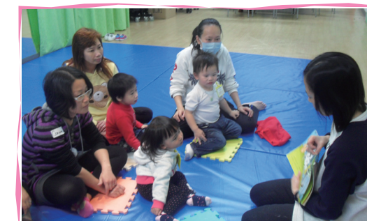
■ Parent-child storytelling workshop - The babies are interested in the story