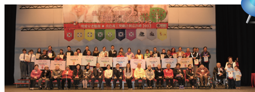
■ Group photo for the awardees