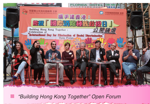
■ “Building Hong Kong Together” Open Forum

The “Building Hong Kong Together” open forum was held on 17 March 2013 at Mong Kok Pedestrian Zone. The guests and ethnic youths shared their concerns and experiences on issues such as language policy, education and employment opportunity. Various cultural promotion programmes had attracted quite a number of passers-by to attend the forum.