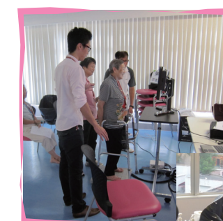
Participants taking the balance test

A total of 4 elderly centres (Central District, Sai Kung, Ngau Tau Kok and Tung Tau) and 1 district elderly centre (Shamshuipo) served as assessment centre for Community Care Fund for Elderly Tenants at Private Housing. This scheme commenced on 9 July 2012 and ended on 31 January 2013. It aimed to provide one-off rental subsidy to non-Comprehensive Social Security Assistance elders residing at private tenements to relieve their financial burden arising from increase of rental charges. A total number of 67 cases were served.