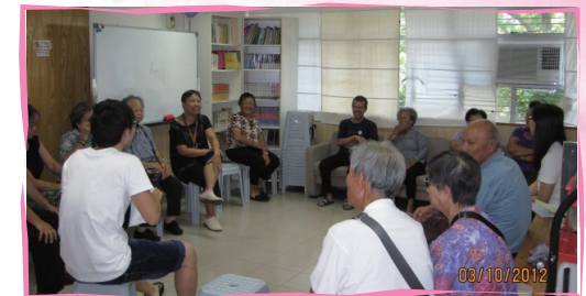
■ Volunteers assisted in a programme for the elderly to discuss the social issues related to the elderly

introduced to the residents various kinds of community resources that were useful for them.