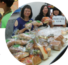
■ Parents were empowered to join the mutual support group which organized re-distribution of unsold bread to express love and concern to the needy