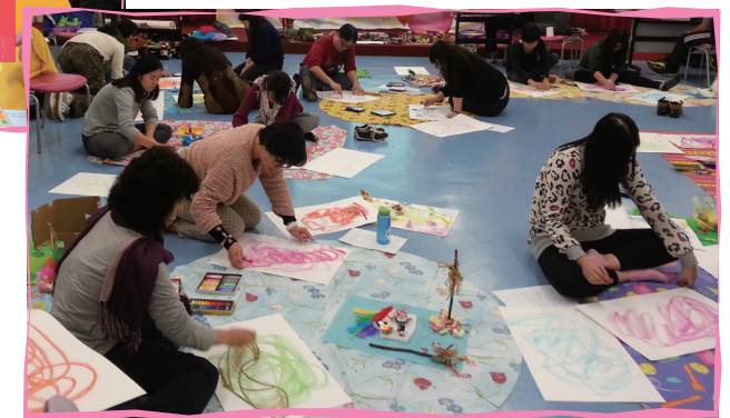
■ Arts-assisted Social Work Practice

The Division expresses its heartfelt thanks to the Catholic Diocese of Hong Kong for its Lenten Fund, and to many donors who provided financial assistance to serve 40,186 needy people, particularly helping the unemployed and under-employed families improve their livelihood. Besides, grants were received from charitable trusts and foundations, government bureaux and departments, as well as corporations to subsidize Caritas service units to launch pioneering projects, to upgrade the facilities and to strengthen the services to serve more underprivileged people.