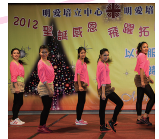
■ The Modern Jazz Dance Group performing in the Christmas Thanksgiving Dinner Party 2012

During the year, the Modern Jazz Dance Group took part in the 33rd Dancing Competition of Shatin District and won the Silver Award. Besides, four students enrolled in Modern Jazz Grade 1 examination of the Commonwealth Society of Teachers of Dancing Examinations in August 2012 and attained Honour awards. It was the first time the students took professional dancing examination, and encouragements should be made to students to pursue this aspiration in future.