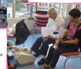
Elders conducting the bone density test