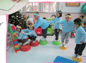
■ Celebration at Christmas - A Children Drama demonstrated “Hope and Love”