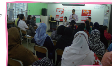
■ Meeting with government officials

large number of members, they could hardly find an appropriate living place at affordable cost and had limited choice amongst the public housing estates. They, including female members, received support from each other inside the group, were able to express their views and air their grievances to the legislators and government officials after the co-ordination of the Centre.