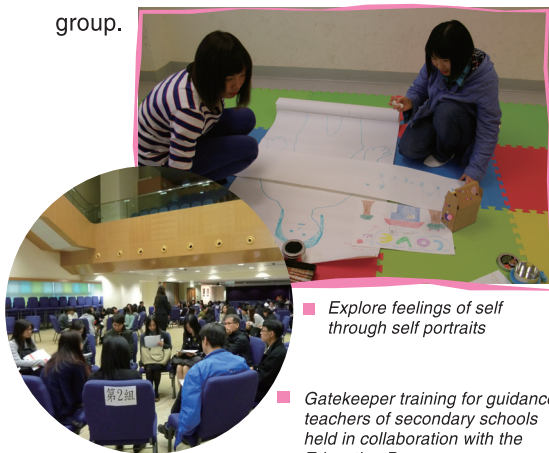
■ Explore feelings of self through self portraits

Year 2012 is the transitional period of New Senior Secondary System. Many students, parents and social workers were confused about the changes in the system. In order to assist young people to face the difficulties, Caritas social workers tried their best to render appropriate advices to the students.