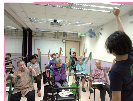
■ Exercise Group