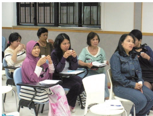
■ In the health seminar, the dietitian explained to the women migrant workers what is healthy diet and how it helps in cancer prevention

Caritas Asian Migrant Workers Social Service Project has empowered the Filipino, Indonesian, Thai Concern Group to strive for the completeness of the Government's annual review exercise on the minimum allowable wage of the foreign domestic helpers ("FDH") to raise the concern of the limited channels to collect opinions and to arrange meetings with the FDH groups. Besides, the Project also launched the projects like monthly medical consultation, health concern day, women's health seminar and stress management workshop. Stressful FDHs have been identified and facilitated to form self-help groups.