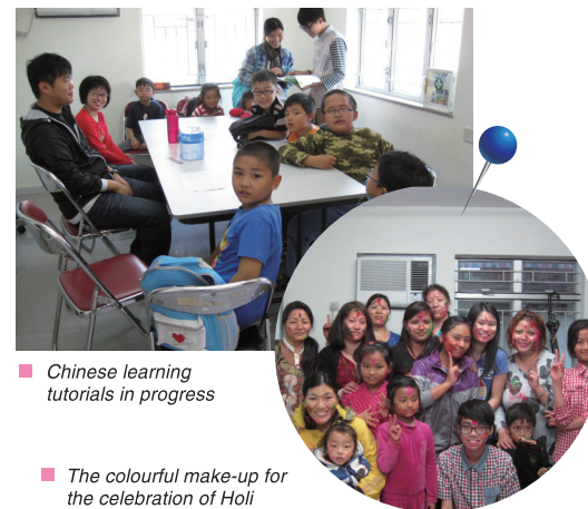
■ Chinese learning tutorials in progress

In collaboration with the "Angel Group" of ethnic minority women, a cultural integration programme was launched under Caritas Yuen Long Rural Community Development Project. It involved 12 local university undergraduates providing free-of-charge Chinese learning tutorials for 18 students from low income ethnic minority families. In return, the ethnic minority parents provided cultural experiences programmes for them. One of the programmes was celebration of Nepalese traditional festival, Holi, which is the festival of colour.