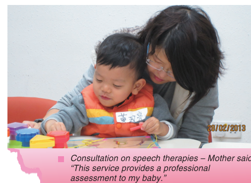
■ Consultation on speech therapies – Mother said, “This service provides a professional assessment to my baby.”