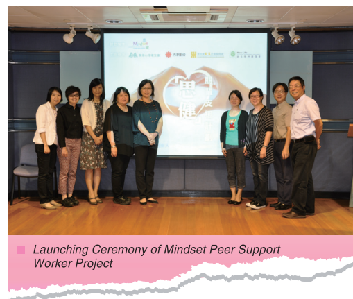
■ Launching Ceremony of Mindset Peer Support Worker Project

The Mindset Limited granted a three-year project fund to implement the “Peer Support Worker” project in the integrated community centres for mental wellness of the Service. Persons recovered from mental illness were trained to take up specially created posting named as “Peer Support Worker” to provide support to cases with similar psychiatric problems. It was targeted that a total of 3 full-time employment places or 6 part-time places could be created to encourage the meaningful engagement of persons with mental illness.