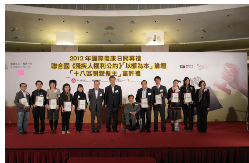
■ Caritas Rehabilitation Service, Caritas Parents Resource Centre, Caritas Second-Hand Recycling Shop and Caritas La Vie Bakery were awarded “Caring Employers in 18 District Councils”