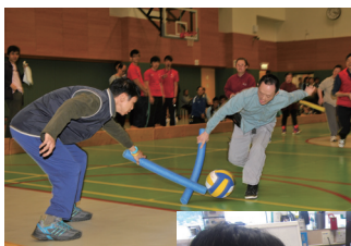
■ Participants enjoyed the fitness games

The Queen Elizabeth Foundation for the Mentally Handicapped had granted $0.47 million to organize special projects to promote the physical wellness, health care and early intervention for the service users with advanced age. Service partners and medical professionals were invited to provide a series of dental inspections and treatment, visual and audio examination as well as fitness games for persons with intellectual disabilities. Over 400 persons with disabilities and 100 parents had benefited from these projects.