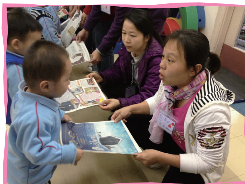
■ Enhancing parent-child relationship through interactive programme

Caritas Kai Yau Nursery School participated in a “Parenting And Child Enhancement - Early Intervention Programme for Pre-school Children from Disadvantaged Families” (“PACE”) conducted by the University of Hong Kong and the Hong Kong Polytechnic University. A series of parent-child training sessions was provided to 12 children and their parents with the aims to promoting the development of pre-school children from disadvantaged families through high quality learning activities and parenting education. The training empowered the parents to become active partners in children’s learning and development.