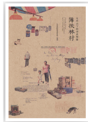
■ The book composed of 21 stories revealing the history of the village in the view of cultural conservation

The workers of Caritas Pokfulam Community Development Project had worked with the residents of Pokfulam Village to publish a new book to record the history of Pokfulam Village.