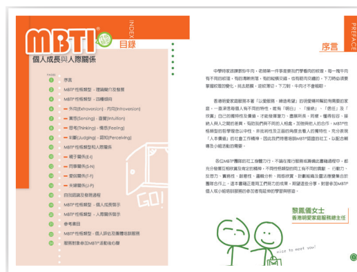
Content and Preface