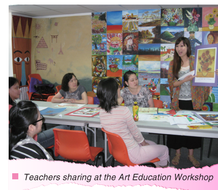
■ Teachers sharing at the Art Education Workshop

To foster the professional development for teachers, a series of workshops and training course on the Orff Music, Montessori education and art education was organized. More than 100 teachers participated. Moreover, four teachers participated in the training programme “Quality English Learning Programmes for Pre-schoolers - Sustainability Programme” organized by the Standing Committee on Language Education and Research of Education Bureau in September 2012.