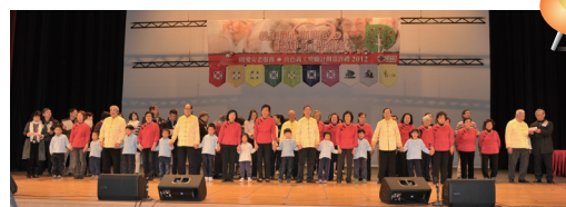
■ Volunteers singing the theme song

To echo to the 10th anniversary of the Volunteer Service Award Programme of the Service, the theme chosen for the Volunteer Award Presentation Ceremony on 5 January 2013 was “義工同心顯關愛 十載同行傳希望”. Totally 1,359 volunteers and 23 volunteer organizations received awards. Apart from presentation of 10 colour medal awards according to the years of volunteer experiences, special awards on continuous commitment, uplifting of volunteer work and frail elder contribution were awarded to 3 outstanding elder volunteers.