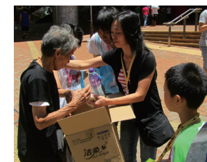
■ Parent volunteer plays a good role model to pass the spirit of love and care to the new generation

Caritas Jockey Club Integrated Service for Young People – Tak Tin has organized a programme named “Bread Delivery Scheme” under the Community Care Project since 2011. A group of volunteers collected unsold bread from some bakeries in the community and re-distributed them to people and families in need. The number of bread re-distribution day increased from 2 days a week to 5 days a week in this year. Many of the bread receivers even joined as volunteers. They experienced the happiness of helping others and built up their own value. Mutual support atmosphere in the community was greatly enhanced.