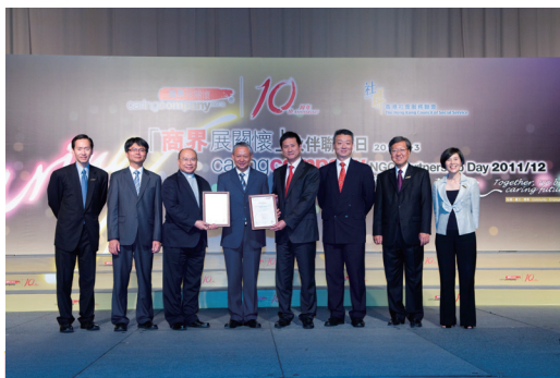
■ Caritas - Hong Kong and Hong Kong Disneyland Resort were granted the Caring Company “Outstanding Partnership Project Award” for their joint effort in promoting employment of persons with disabilities

Caritas Lok Mo Integrated Vocational Training Centre had won the “Outstanding Partnership Project Award” of the Caring Company Event organized by the Hong Kong Council of Social Service. The award devoted a public recognition of its effort in collaborating with the Hong Kong Disneyland Resort to promote the employment opportunity for the disabled trainees through the “Apprenticeship Programme for People with Disabilities”.