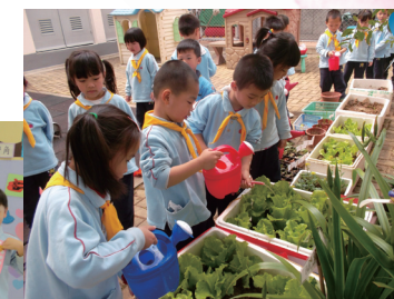
■ Cultivation of “Care and Love” - The Green Gardener