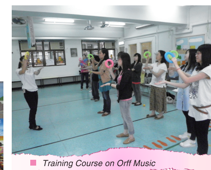
■ Training Course on Orff Music

The Annual Departmental Evaluation Seminar for Teachers and Principals 2012 with the theme “Visioning a Relational Culture for Pursuing Quality Early Childhood Education and Care Service” was held on 21 July 2012. Small group discussion with the focus on building a relational organization and school from various perspectives, including holistic development of young children, support to families and parents, and development of a professional teaching team that incorporates Agency’s Vision, Mission and Value was conducted.