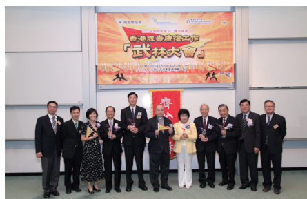
■ Opening ceremony of the Exchange Camp for Drug Treatment and Rehabilitation Workers — a joint programme with the Hong Kong Council of Social Service and Hong Kong University of Science and Technology

The Caritas Lok Heep Club is well recognized with its expertise in running training and exchange activities for drug workers. It has been granted support from the Beat Drugs Fund to run a two-year “Drug Knowledge Project”. A total of 11 trainings and exchange activities were organized from 16 November 2010 to 15 November 2012. The climax of the project took place on 25 June 2012 and 26 June 2012. Over 250 individuals from more than 90 agencies/work units attended the Exchange Camp for Drug Treatment and Rehabilitation Workers at the Hong Kong University of Science and Technology.