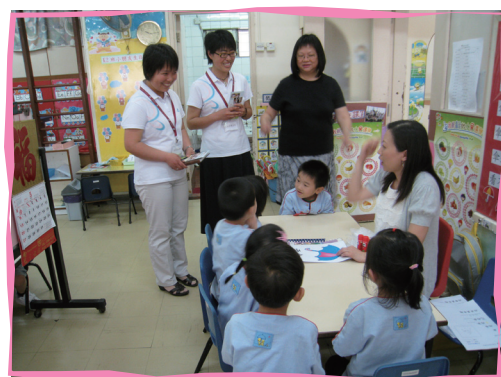
■ Classroom observation on small group learning of children

on the active learning of young children, they were mostly impressed by the culture of love and care of the teaching team, especially the work with the underprivileged families.