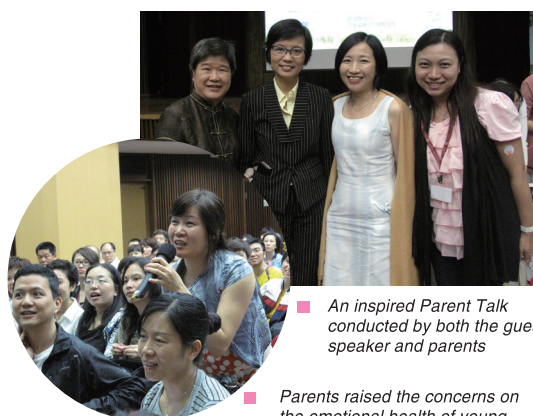
■ An inspired Parent Talk conducted by both the guest speaker and parents

With the grant from the Committee on Home-school Co-operation of Education Bureau, a Joint School Parent Talk with the theme “Love Conveyance with Hope - A Healthy Family, A Happy Childhood” was held on 19 May 2012. The Development Director of Family Heartware was invited to conduct a talk on positive parenting which inspired more than 500 participated parents.