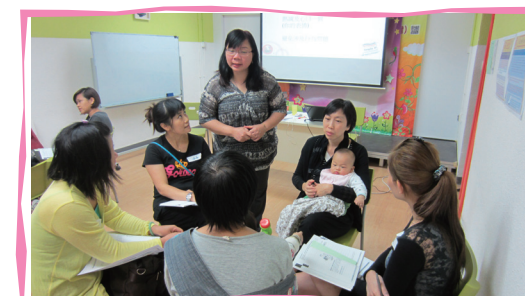
■ Triple P® parent education course - Parents learn the positive parenting skill