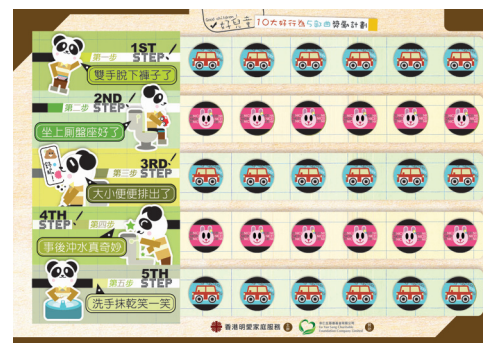
■ Children’s 10 positive behaviour in 5 steps: a reward chart developed to help children develop positive life and learning skills in clear and easy-to-follow steps

With sponsorship from the Eu Yan Seng Charitable Foundation, 20 families with children suspected of developmental delay received Individual Education Programme, Filial Play Therapy and Positive Parenting Programme provided by Family Service. Outcome analysis showed a positive programme effectiveness: children’s developmental delay and their parents’ parental stress were lessened significantly, as indicated in pre- and post-training scores in the “Screening Scale for Pre-school Children’s Development” and the “Parenting Stress Index-Short Form”.