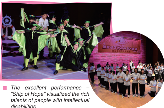
■ The excellent performance – “Ship of Hope” visualized the rich talents of people with intellectual disabilities

With funding support from the Queen Elizabeth Foundation for the Mentally Handicapped, Learning and Development Centre (“LEAD Centre”) organized a graduation ceremony cum talent show on 13 October 2012 at the Hong Kong Academy for Performing Arts. The main theme of the ceremony was “LEAD@different” to illustrate that persons with disabilities were all having distinct abilities which could be explored through life learning and opportunities. More than 550 trainees had been awarded certificates of different levels and being recognized in their efforts in continuous learning. The stage performance of the trainees during this occasion had won great applause from the audience.