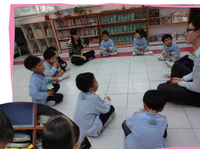
■ A parent-child group to learn through play