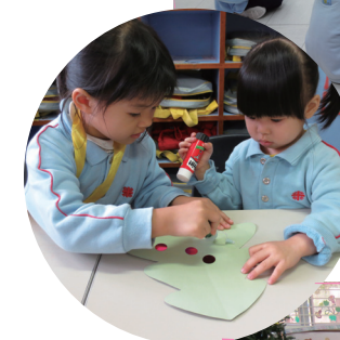
■ “Big Sisters’ and Brothers’ Scheme”

A donation in the amount of $1,432,313 from the Hung Hing Ying and Leung Hau Ling Charitable Foundation was received for supporting a two-year new project named “Start from the Early Age – Learning and Growth Enhancement Programme for Young Children”. The project was collaborated by Caritas Youth and Community Service and Caritas Child Care Service commencing from 1 August 2012. Five nursery schools located in Kowloon East and Hong Kong East conducted stationing nursery school social work services which aimed at early identification and prevention of families’ crisis and providing early intervention for children with special educational needs.