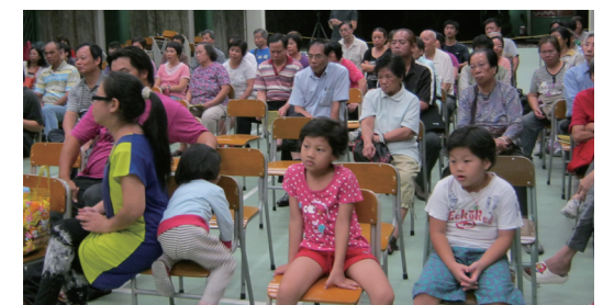
■ Residents participated in the meeting with Yuen Long Police Community Relations Officer

The Tan Kwai Tsuen, Wo Ping Sun Tsuen Squatter Area Residents Concern Group, formed by Caritas Hung Shui Kiu Community Development, has been working with the residents to respond to the Hung Shui Kiu New Development Area Planning for a few years. In this year, the Concern Group held a residents' meeting with the Yuen Long Police Community Relations Officer that allowed the chief inspector to clarify the role of police in the housing clearance procedures and direct communication between the residents and the police force.