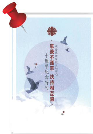
■ The new booklet with the theme "single parent not lonely, mutual help in the livelihood"

A booklet consolidating the working experiences with single parents in the past ten years was published.